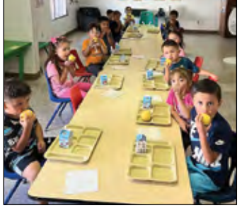
Above: Pre-K students enjoy healthy snacks; Left: Playground fun with sand

Assistant teachers, and to work alongside our devoted families. Together we will build a strong foundation, ensuring that our Pre-K program remains a place of love, learning and growth.