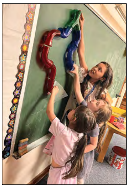
Left: Budding architechs create a house; Right: Learning the power of magnets