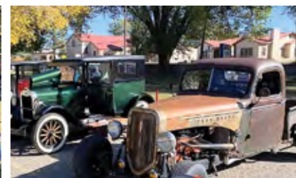
Bounce Obstacle Course at Fiesta and several of the beautiful cars on display honoring our 110 Years