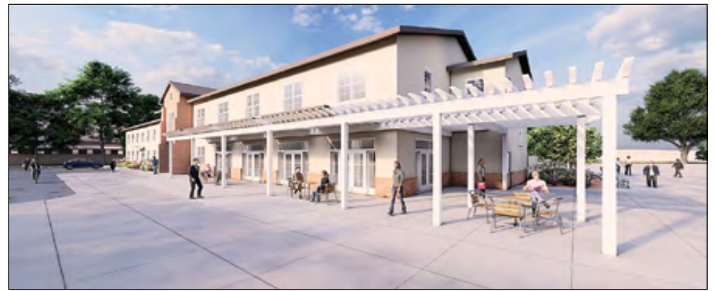
Above: View from the east of the remodeled Bachman Hall which will become a Retreat Center. Below: View from the south of the new Program Building. Renderings provided by fbt architects.

This plan will “right-size” the McCurdy campus, include solar installations making energy efficiency a reality and will mean less McCurdy funds will go to insurance, utilities and maintenance and more will go to fund ministry.