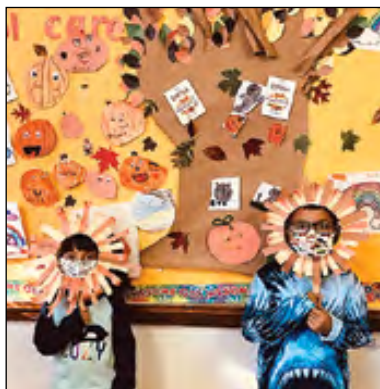
ASC students enjoy lion's manes.

Afterschool Care (ASC) has 39 students including 17 boys and 22 girls. Thanks to the generosity of the Montei Foundation, the Texas Methodist Foundation, and a NM Conference Thaxton grant ASC is free for all McCurdy Charter School students and is aimed at helping students recover from educational losses that occurred during the pandemic. The staff assists students with homework and parents with any concerns about their child.