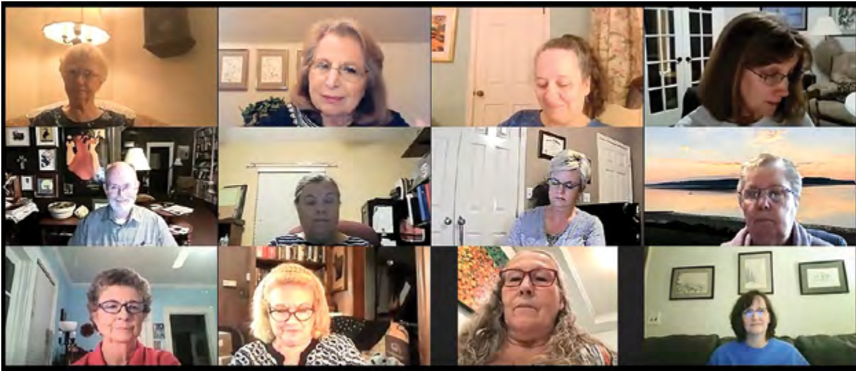
Participants in the Oct. 18–23 McCurdy Virtual Mission as they gathered on Zoom.