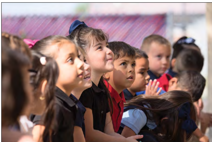
McCurdy preschoolers listening intently to their teacher.