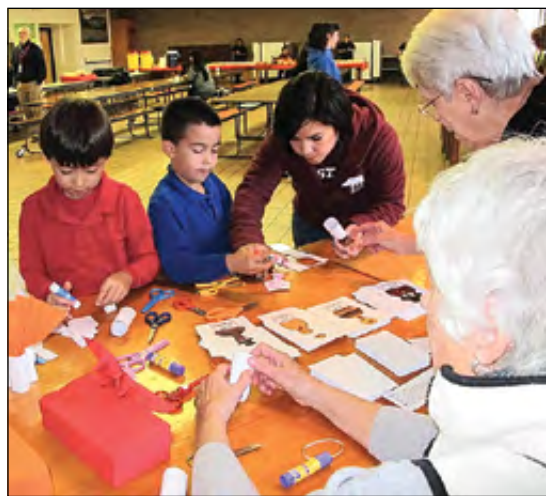
First UMC Los Alamos on the right help McCurdy students with crafts during a Thanks Fest.