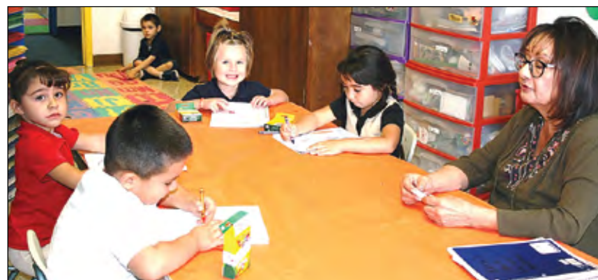
Preschoolers enjoy coloring with their educational assistant.

"What I like about Project Cariño is that they're very involved in McCurdy students' mental health and make it a priority to make sure students' problems are addressed. Project Cariño gave me another friendship and another source of connection that whenever things aren't going well I can go to them automatically and tell them what's going on. I guess I can call them my best friends."