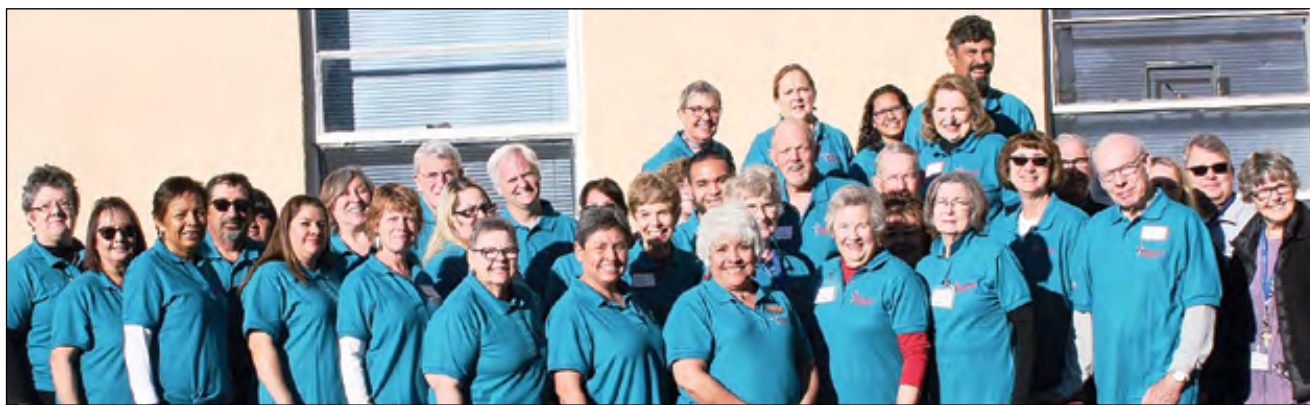
Over 50 McCurdy staff, board members and volunteers from Oklahoma, New Mexico, Ohio, Texas, Minnesota, Indiana and Kansas worked together to make the McCurdy Fiesta a success