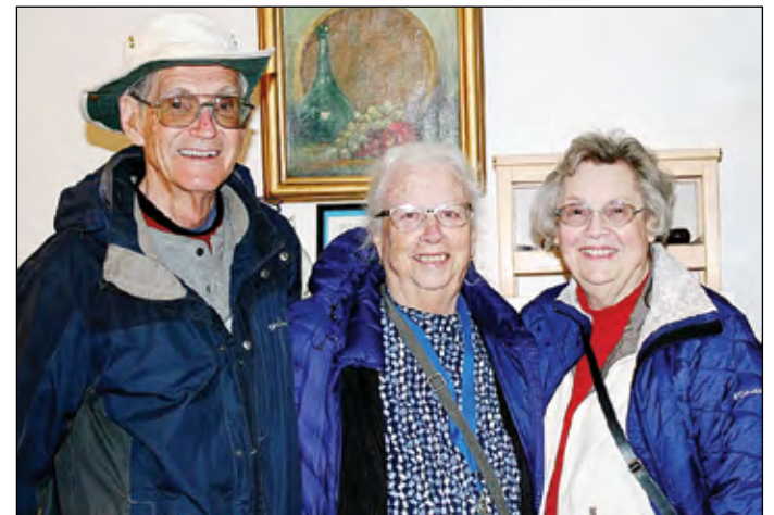
Volunteers from Illinois and Indiana made a big difference on campus this winter.