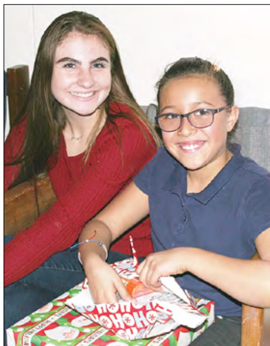
Left: A Big Buddy and Little Buddy enjoy opening a Christmas present.

"Even if I knew that tomorrow the world would go to pieces, I would still plant my apple tree today."