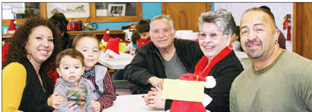
A preschooler and his family enjoy the preschool Christmas party.