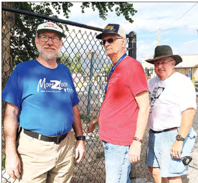
Above: Ohio volunteers from Sulphur Grove UMC are installing a fence. Below: Screen shot of the February 2019 McCurdy Volunteer News which is emailed on a monthly basis.

McCurdy Ministries Community Center creates hope and empowers the lives of children, youth, adults and families through education, life skills and faith-based programs in Española, NM February 2019