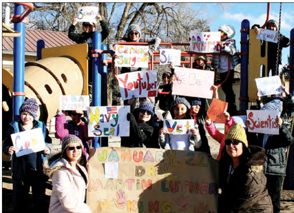
After School Care students & staff display their MLK Day & their dream signs on the playground.