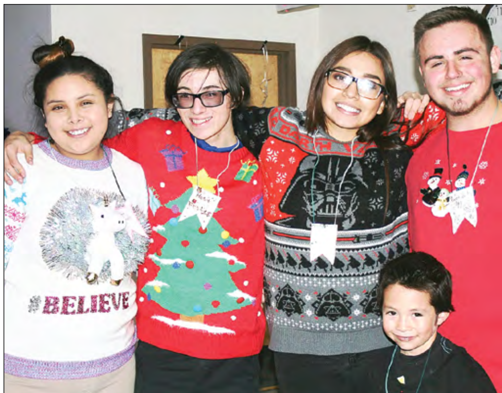
Above: Project Carino Big and Little Buddies celebrate after their Ugly Sweater Contest at their Christmas party.