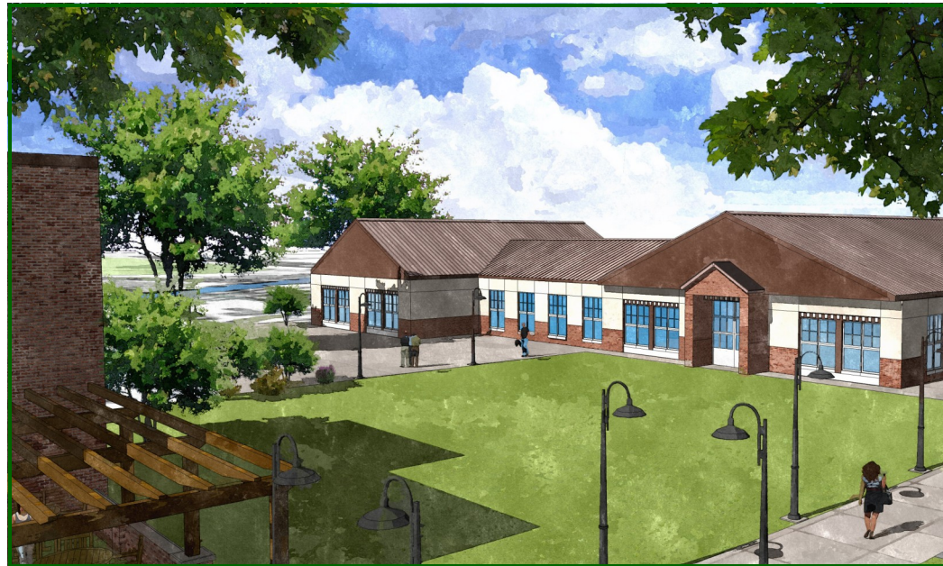
Children's Ministry Center view of the south façade.