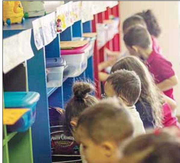
Above left: preschoolers play shape bingo. Below left: a proud preschooler shows off his backpack. Left: Preschoolers put their backpacks into their cubbies and prepare for class.