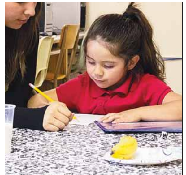
Above: After School Care girl enjoys a snack and homework help.