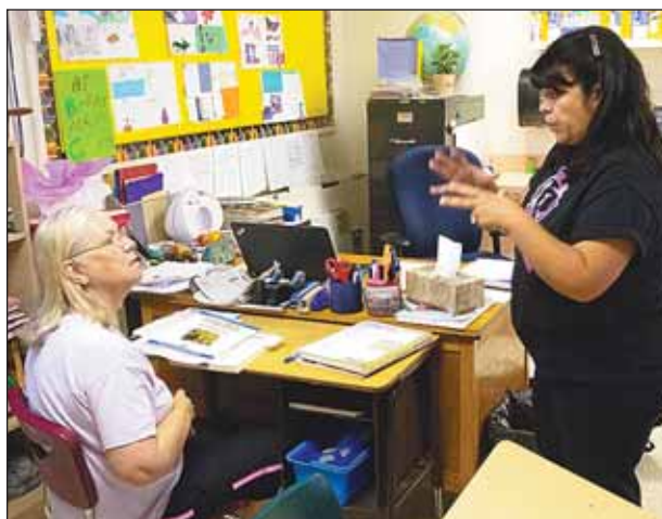
Above: A volunteer and MCS teacher work together to make a difference in the classroom.