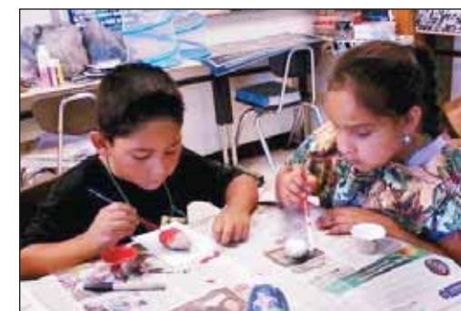
Top left: Camp Stars participants enjoy a craft making session. Bottom left: Camp Stars participants enjoying a science lesson on bubbles at their field trip to the Explora Museum in Albuquerque.