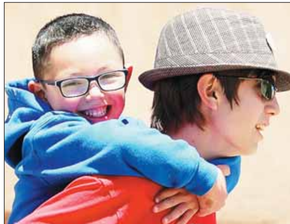
Above: A Big Buddy and Little Buddy have fun.

Since 1985 Project Cariño has provided therapy free of charge to McCurdy students and their families. For the 2014–15 school year we had two full time therapists, three student interns and a therapy dog named Compa on staff and they shared 3,900 contact hours with students doing therapy, classroom presentations, crisis interventions, the Big Buddy/Little Buddy Program, the Peer Conflict Mediation Program and the Celebrate Survival Program. This averages out to more than seven contact hours for every McCurdy Charter School student. We believe Project Cariño plays an important part in the charter school achieving a 82% graduation rate. We thank the Montei Foundation, the Northern New Mexico United Way, the Con Alma Foundation, the Santa Fe Community Foundation, the McCurdy Gala and the individuals, churches and UMW units who make this priceless ministry possible.