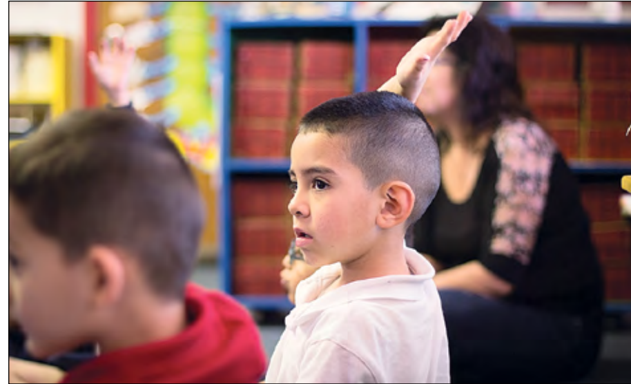
Preschooler with an answer to the question.