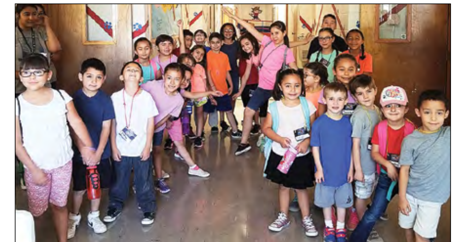
Camp Stars students celebrate in the halls of the Children's Ministries Center.

The "summer slide" is the well documented loss of learning that occurs over the summer break if a student doesn't participate in a summer learning program. Camp Stars, McCurdy Ministries Community Center's summer educational enrichment camp was created to combat the "summer slide." Completing its fifth year, Camp Stars is a six week, 35 hour per week camp which includes STEM education (science, technology, engineering and math) and faith sharing through Vacation Bible School that offers fun and service. This year 34 campers from kindergarten to 6th grade participated in Camp Stars which included science experiments, math exercises, field trips, service projects, art, drama, crafts and singing, all while learning more about God, Jesus and our Christian faith. One parent said about their child's experience with Camp Stars, "Thank you for doing a great job of combining learning, Bible study and fun!" A camper said "I enjoyed this summer with all the new kids I met. I'm looking forward to coming again next summer." We thank the Montei Foundation making Camp Stars possible by being our major Camp Stars donor for the fifth summer! We also thank the Rio Arriba County Summer Food Program for providing breakfast and lunch for our Camp Stars participants.