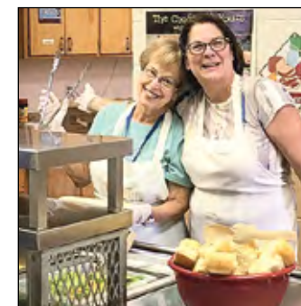
Volunteers enjoying work in the cafeteria.

At McCurdy Ministries Community Center (MMCC), we understand that having a fun, educational and faith-based After School Care program is critical to the after school safety of our students. MMCC cares for 19 preschool to 6th grade students every school day through this faith-based program. At After School Care, students enjoy free play, snacks, homework help and educational games as well as faith-building art, crafts, drama and Bible study. A small tuition is charged to help support the program but families that qualify for free or reduced lunch are eligible for financial aid. One of our returning students, when asked about the first day back after summer vacation said "This is my family, I missed you guys." We are grateful to the donors and volunteers that support After School Care and help keep our students safe.