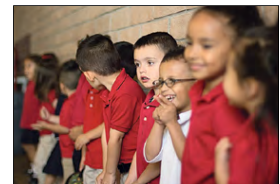
Preschoolers in line for lunch.

McCurdy Ministries Community Center (MMCC) is the vendor for the McCurdy Charter School Breakfast and Lunch Program; we also feed our preschoolers every school day. Although the majority of meal costs are reimbursed by the USDA, MMCC financially supports this program because federal reimbursements are not enough to feed our children healthy meals. During the 2017-18 school year we provided 55,538 meals to our preschool and K-12 students. Research shows that hungry children don't learn and unfortunately many of our children don't get regular meals at home, so we truly understand how critical this aspect of our ministry is to our students. We take Jesus' command to "Feed my sheep" seriously. Our Breakfast and Lunch Program reflects the importance of Jesus' command.