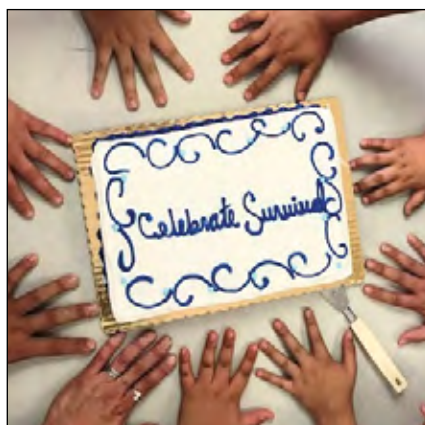
Project Cariño participants in the Celebrate Survival Retreat enjoy cake.

For 34 years Project Cariño has provided therapy free of charge to McCurdy students and their families. We employ three therapists, four master-level interns in clinical training and a therapy dog in training. During the 2017-18 school year our counselors and interns provided over 4,488 contact hours with students doing therapy, classroom presentations, crisis interventions and the Big Buddy/Little Buddy and Celebrate Survival Programs. Our counselors also led groups on anti-bullying, boys self-esteem and anxiety support. Student therapy includes play therapy for younger students, talk therapy for older students and family therapy when appropriate. The difference Project Cariño makes with our students is best demonstrated by testimony from a student receiving therapy "Project Cariño is a place where I feel comfortable and supported, a place where I don't feel alone. Everyone at Project Cariño is there to help and support you...Knowing that I have Project Cariño makes my life a lot easier." A Big Buddy states, "I have noticed the effect Project Cariño has had on my Little Buddy. The time spent coming to Project Cariño has made him smile and helped him get away from problems at home and at school." We thank the Montei Foundation, the Northern New Mexico United Way, the Con Alma Foundation, the UMW National Office and all the individuals, churches and UMW units whose donations make this priceless ministry possible.