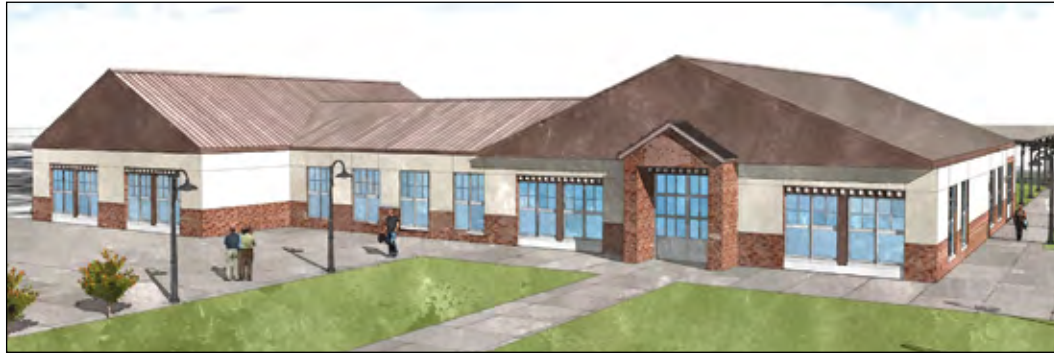
Architectural rendering of proposed renovations for the Children's Ministries Center. (FBT Architects)