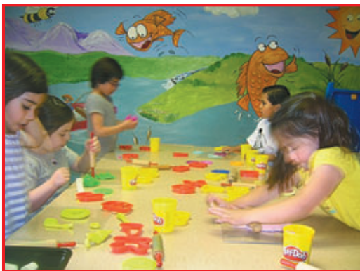
Preschoolers have fun with Play Doh.

Last spring McCurdy Ministries made a decision to try a new approach to our preschool program. We applied to the New Mexico Children, Youth and Families Department to open a free morning Pre-K Program for up to 20 four year olds the fall of 2014 and received a three year $60,000 per year grant to fund the program for three years and $15,000 in startup funds. In addition, we planned a low cost faith based afternoon preschool which is