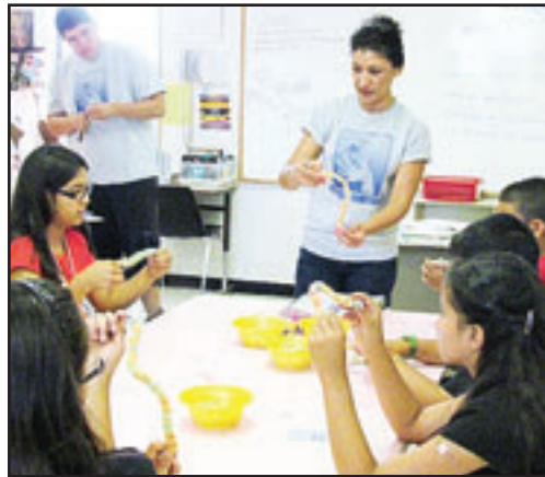
Camp Stars kids learn about DNA with their teacher and counselor.

I finished my degree in 2010, and that same year, a gas pipeline explosion occurred in San Bruno, CA, not far from where I was living. I signed on with the United Methodist Committee On Relief (UMCOR) to be a long-term recovery case manager for that community, and worked with the families affected by the